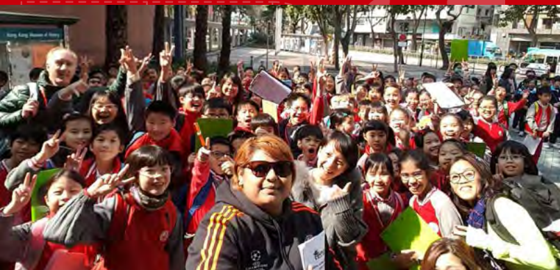
We had a fun and fruitful learning journey at The Hong Kong Museum of History!