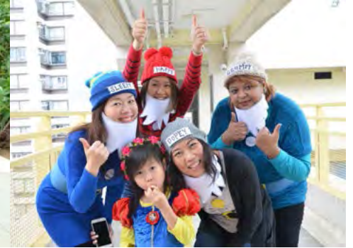
Students and teachers enjoying SISHK Library Week's Book Character Dress-Up Day.