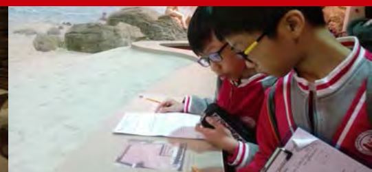
The last gallery of The Hong Kong Story traces the story of Hong Kong's postwar development into a modern metropolis. The information about advances in housing, industry, finance and trade is very interesting!