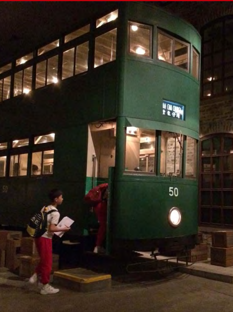
This is the Birth and Early Growth of the City Gallery where we got to see an old street scene lined with a variety of shops: tea shop, tailor's shop, pawnshop, post office etc. There is even a double-decker tram!

Towards the end of the learning journey, we felt that the visit to the museum was a very dynamic and hands-on way to learn about Hong Kong's history. Although we were very exhausted, our hard work finally paid off and our activity sheets were completed. We were indeed grateful to have the opportunity to have an out-of-school learning experience. The learning journey truly solidified what I learnt in class and in the next few lessons as we continued discussing Hong Kong's history I was able to picture everything in my mind as my teacher was teaching.