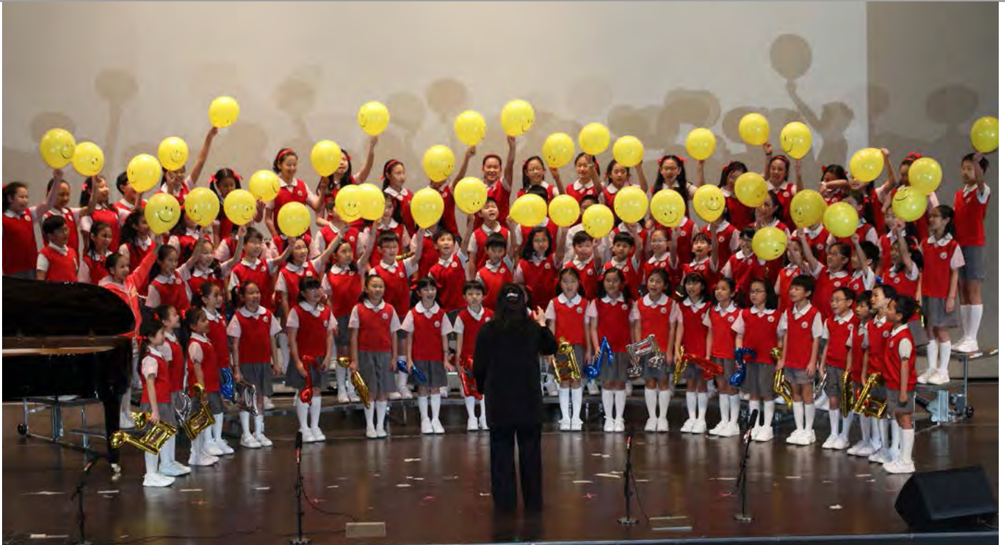
Students wish SISHK a happy 25 th anniversary at the students' celebration activities.