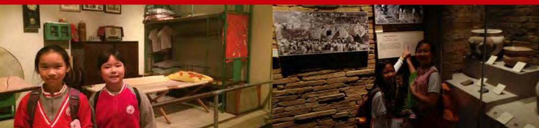
We discovered many things that we did not know about in the Prehistoric Hong Kong Gallery.