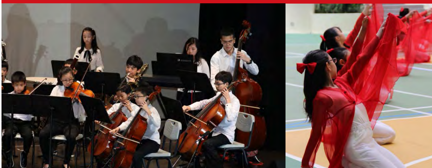
Students from PY dance, the School Orchestra, Upper Primary Dance CCA, Primary Drama CCA and Secondary Chinese Culture Connection perform at the 25 th Anniversary Concert.