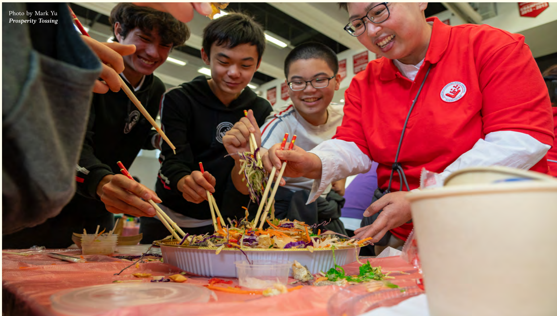
Prosperity Tossing