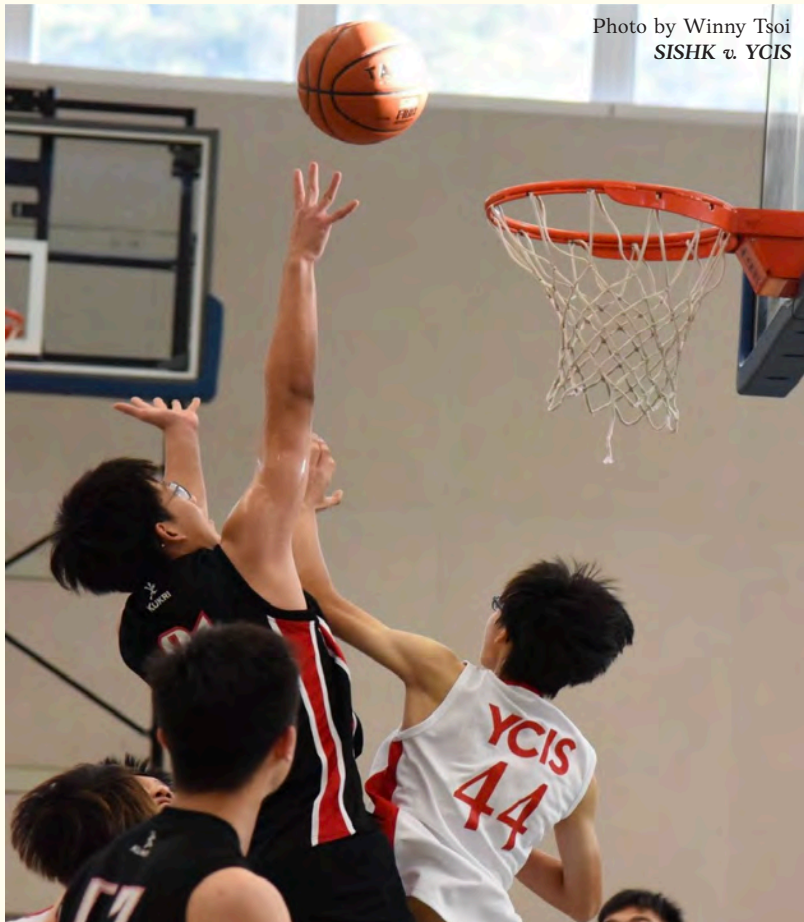
SISHK v. YCIS