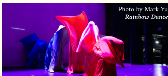
Rainbow Dance

As the Winter Ball came to a close, the talented performances, Student Council’s meticulous planning, and the enthusiastic participation of the attendees left a long-lasting impression on everyone. Overall, the Masquerade-themed Winter Ball of 2024 was a huge success that offered an unforgettable night of enjoyment, festivity, and celebration, and will no doubt be remembered as a highlight of the academic year.