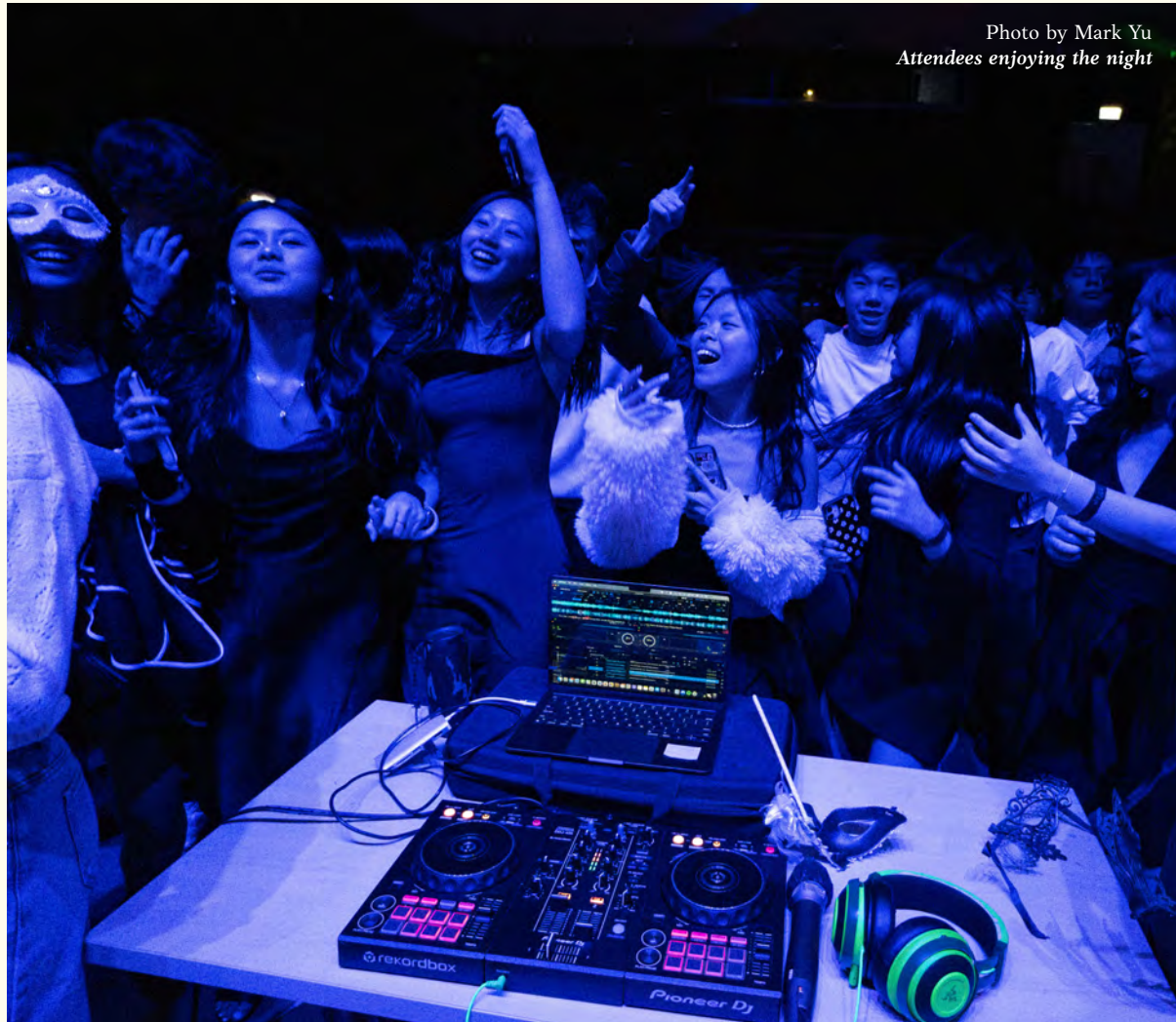
Attendees enjoying the night